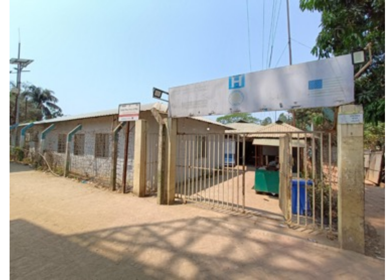
Tdh-run PHC 2 (Camp 27 - Teknaf) – Main Entrance