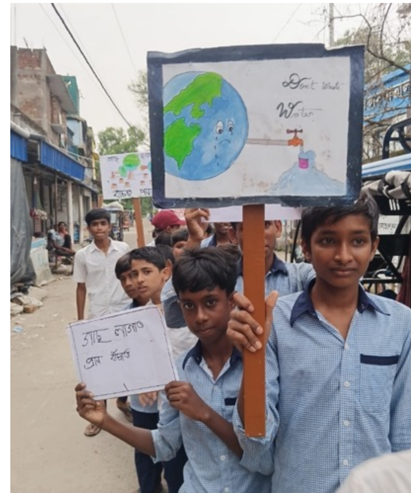
Child-led rally organized in India