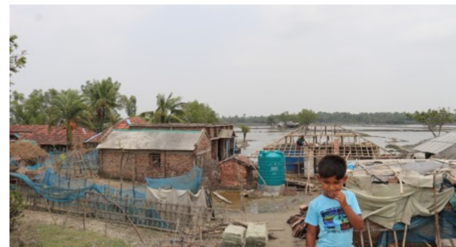
Young boy in the flood-devastated village of Bichat, Satkhira District, Bangladesh