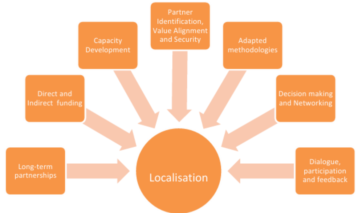
Graph 1 - Terre des hommes' principles towards Partnerships for Localisation